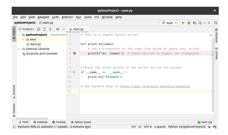
Figure 4: User interface of the PyCharm IDE