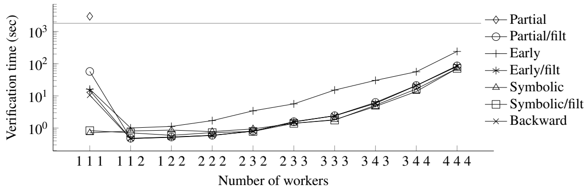
Figure 3: Evolution of the verification time for the formula \langle\langle \text{Worker}_1, \text{Worker}_2 \rangle\rangle \mathbf{F} all defeated.

Figure 3 shows the evolution of verification time of the seven approaches for checking the formula \phi_2 . This formula is false for all checked sizes.