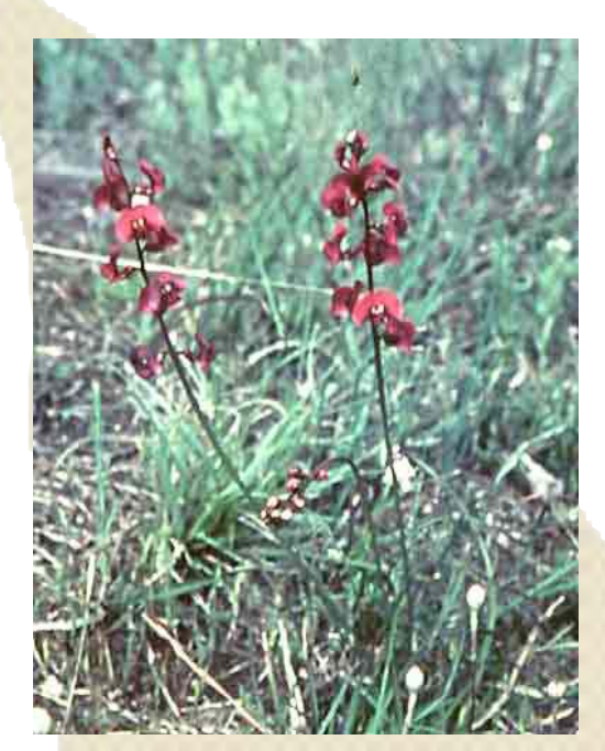
Small Purple Pea, P.Ormay Environment ACT

The Small Purple Pea (Swainsona recta) is a declared endangered plant species in the ACT. It has also been declared as endangered in NSW and Victoria and by the Commonwealth. It is a slender, erect, perennial plant called a forb—meaning it is a non-woody plant that is not a grass, sedge or rush. It grows up to 30cm high and has attractive purple flowers between 5-6mm long, borne in racemes (or spikes).