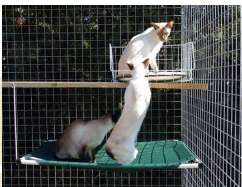
Kimba, Ayesha, and Felix cats in their Catopia Home.

body and they can pass this disease on to humans and other animals through their faecal matter during the initial 20 days of infection. Humans also can get infected through eating the under cooked meat of infected animals. The disease is rather mild but can cause serious problems for people with immunodeficiency conditions or under going pregnancy where miscarriage and severe birth defects can result.