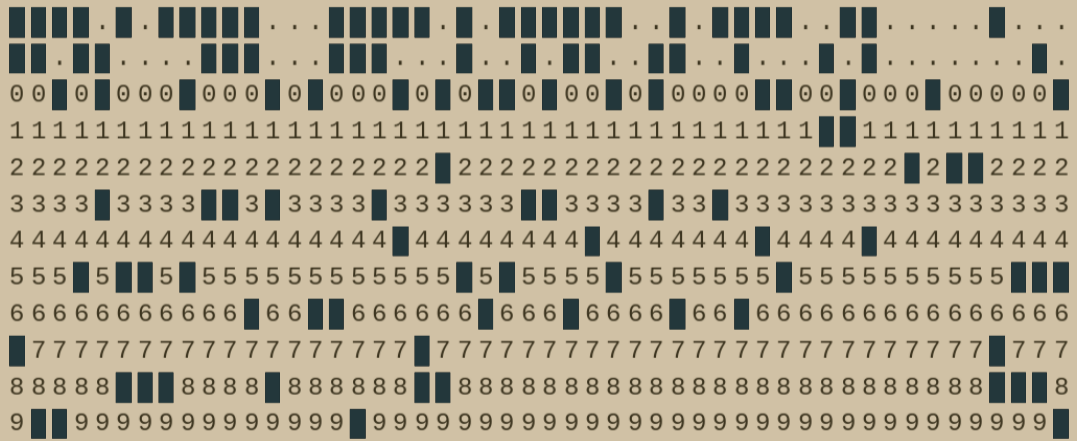
Figure 7: punch cards