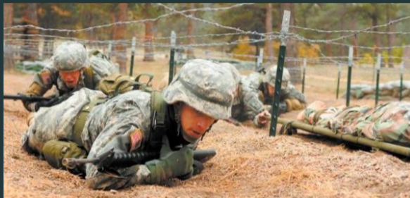
Figure 2: COMP1521