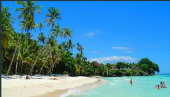
Figure 3: COMP1521