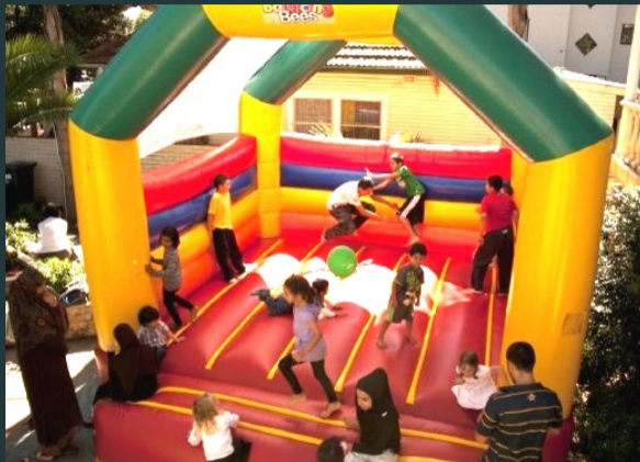
Figure 1: COMP1511/1911