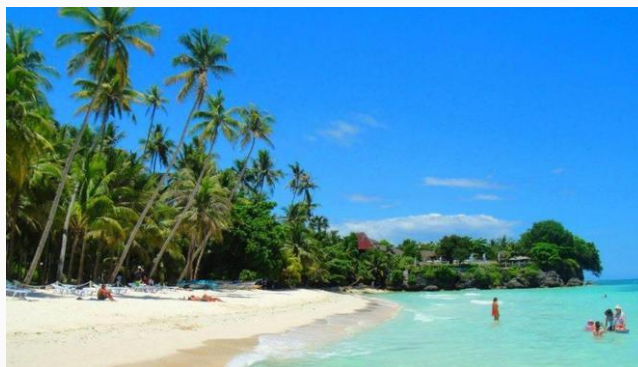
Figure 3: COMP1521