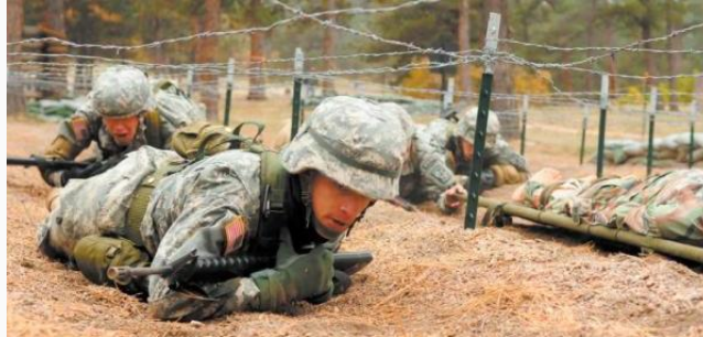
Figure 2: COMP1521