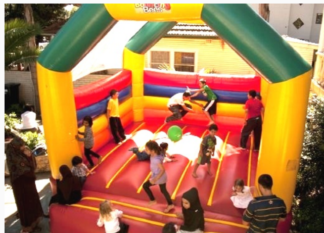
Figure 1: COMP1511/1911