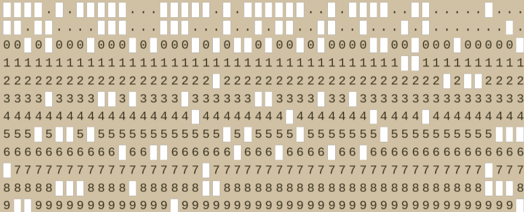
Figure 7: punch cards